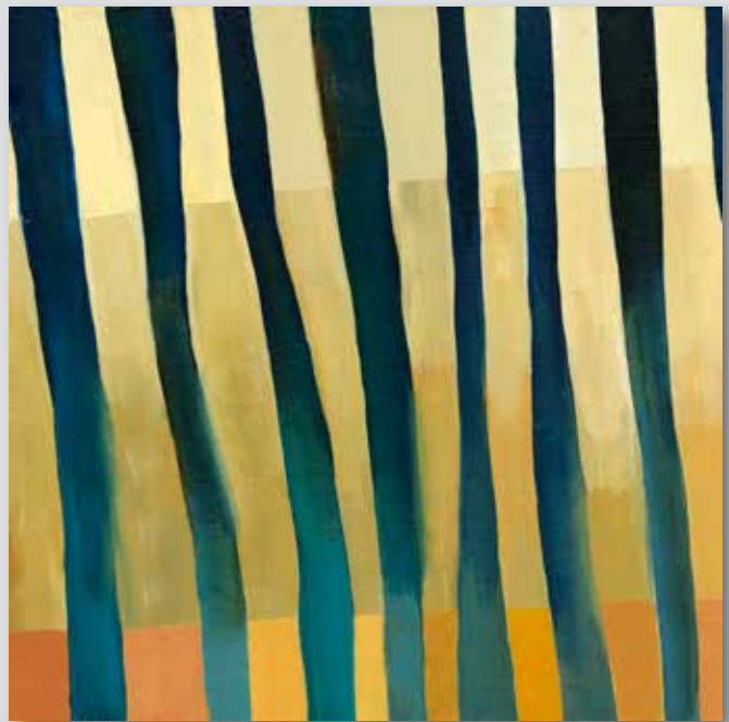
Line in the Sand #2 12"x12", acrylic on wood panel