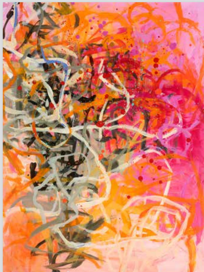
Loophole #1 18"x24", acrylic on paper