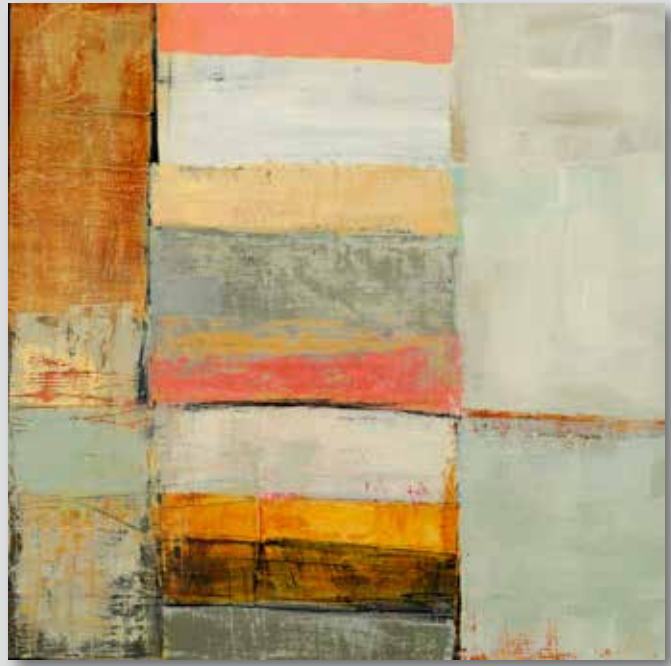
Stacked Stripes #11 12"x12", acrylic on wood panel