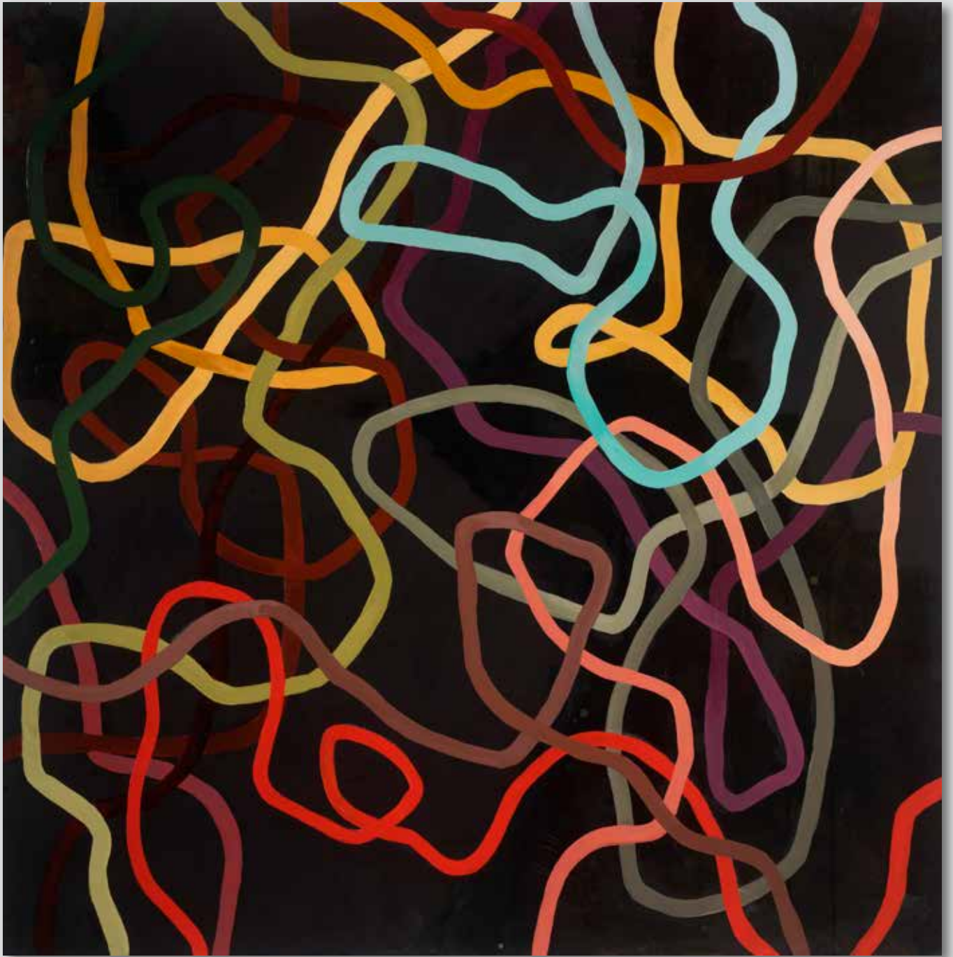
On The Loose , 36"x36", acrylic on canvas