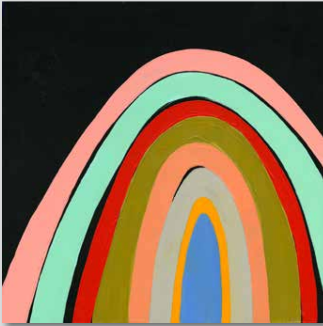
The Other Way Around #2 10"x10", acrylic on panel