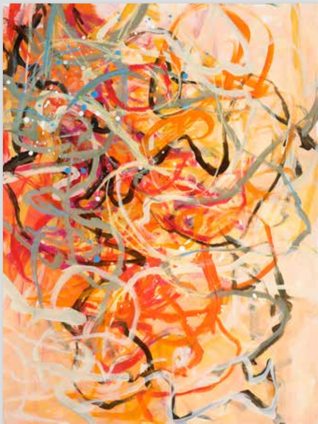
Loophole #2 18"x24", acrylic on paper