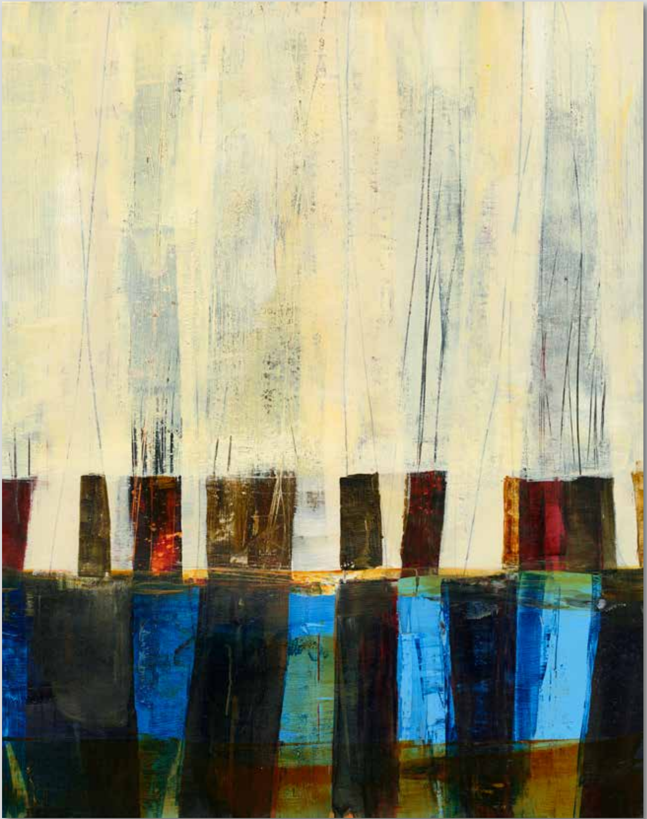
Slacktide #1 11"x14", acrylic on paper