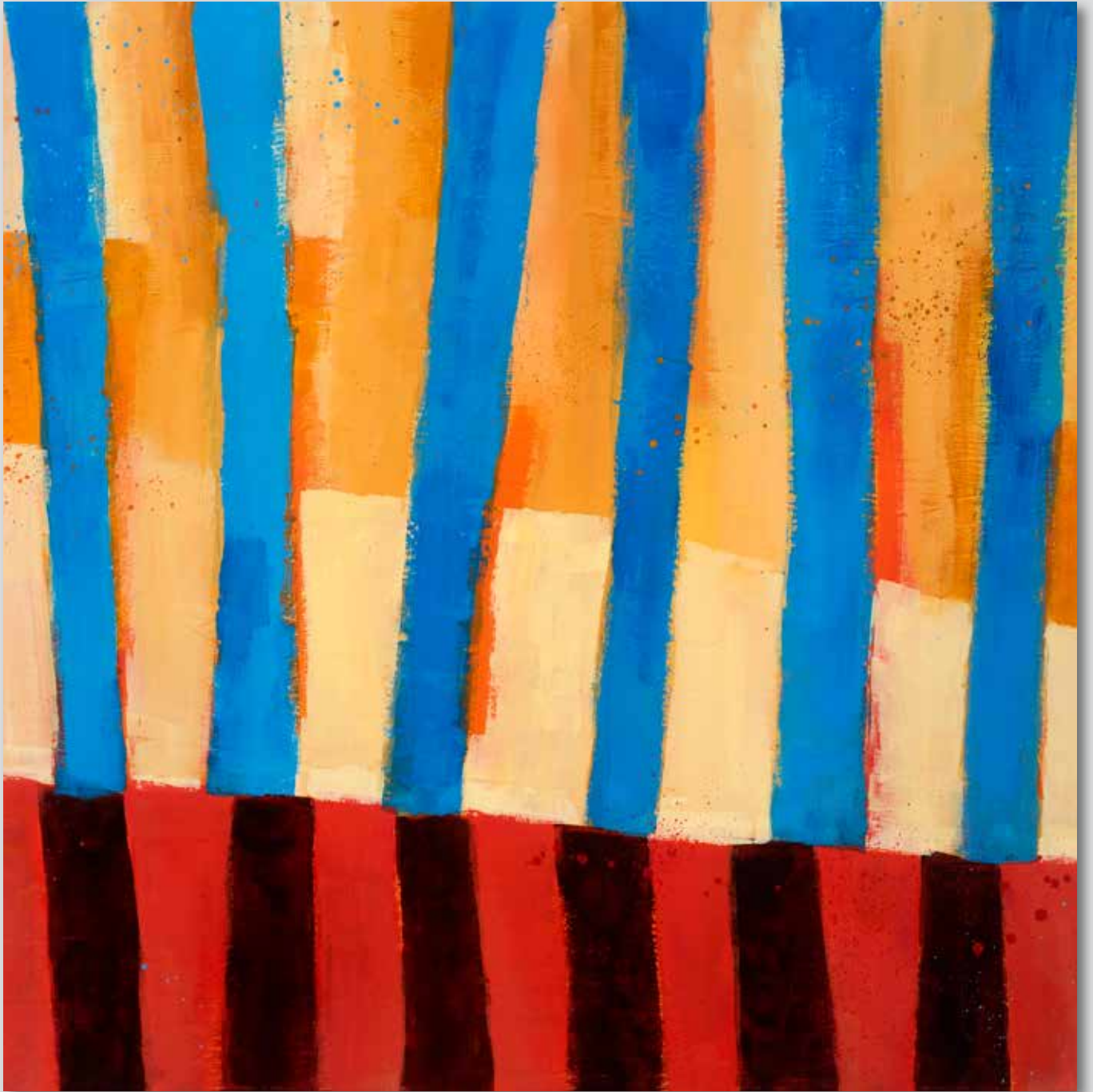
Reading Between the Lines #4 24"x24", acrylic on wood panel