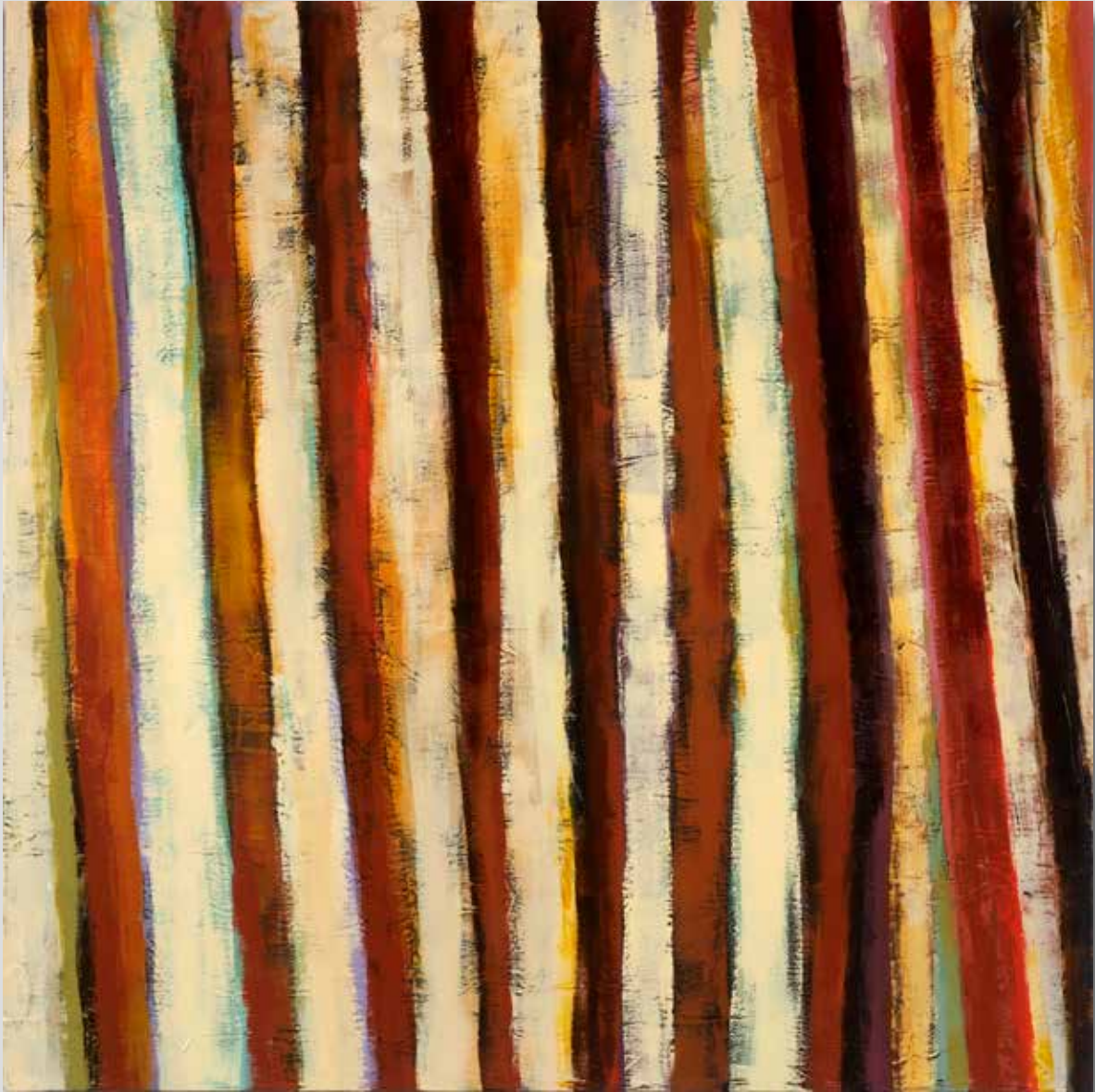
Reading Between the Lines #2 36"x36", acrylic on canvas