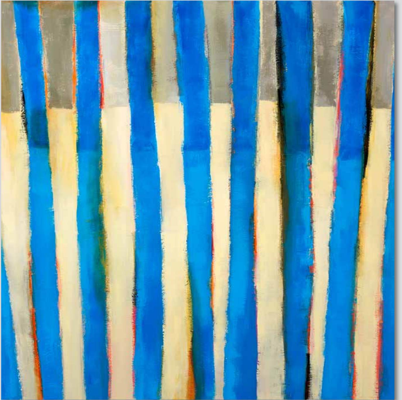
Reading Between the Lines #3 30"x30", acrylic on canvas