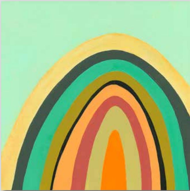
The Other Way Around #1 10"x10", acrylic on panel