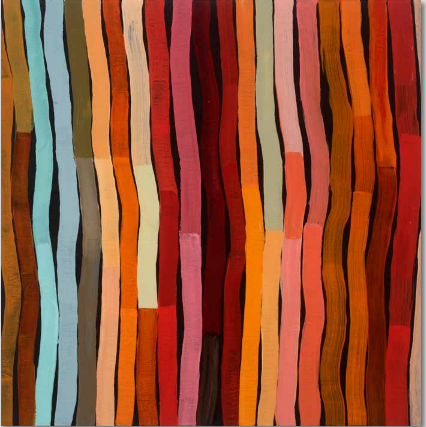
Going with the Flow #1 , 20"x20", acrylic on wood panel