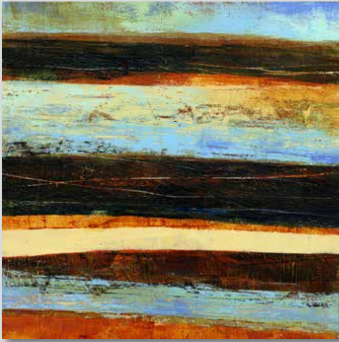
Stacked Stripes #19 10"x10", acrylic on wood panel