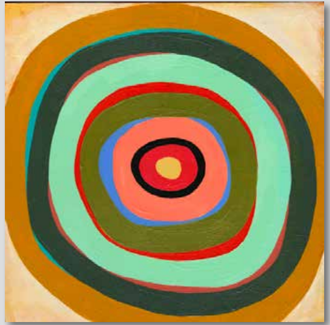
Moving Target #1 10"x10", acrylic on panel