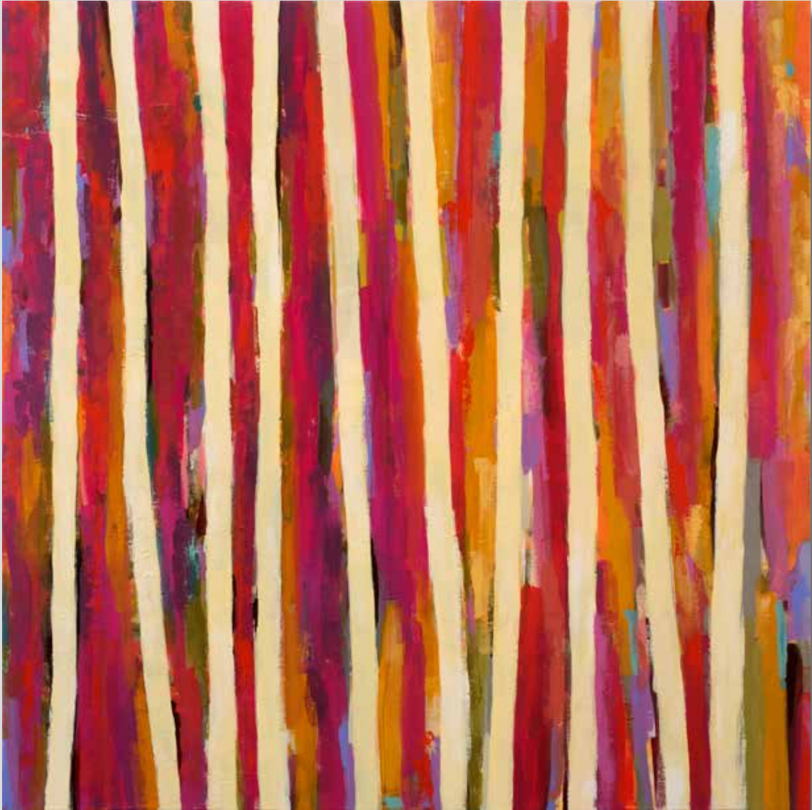
Reading Between the Liens #1 30"x30", acrylic on canvas