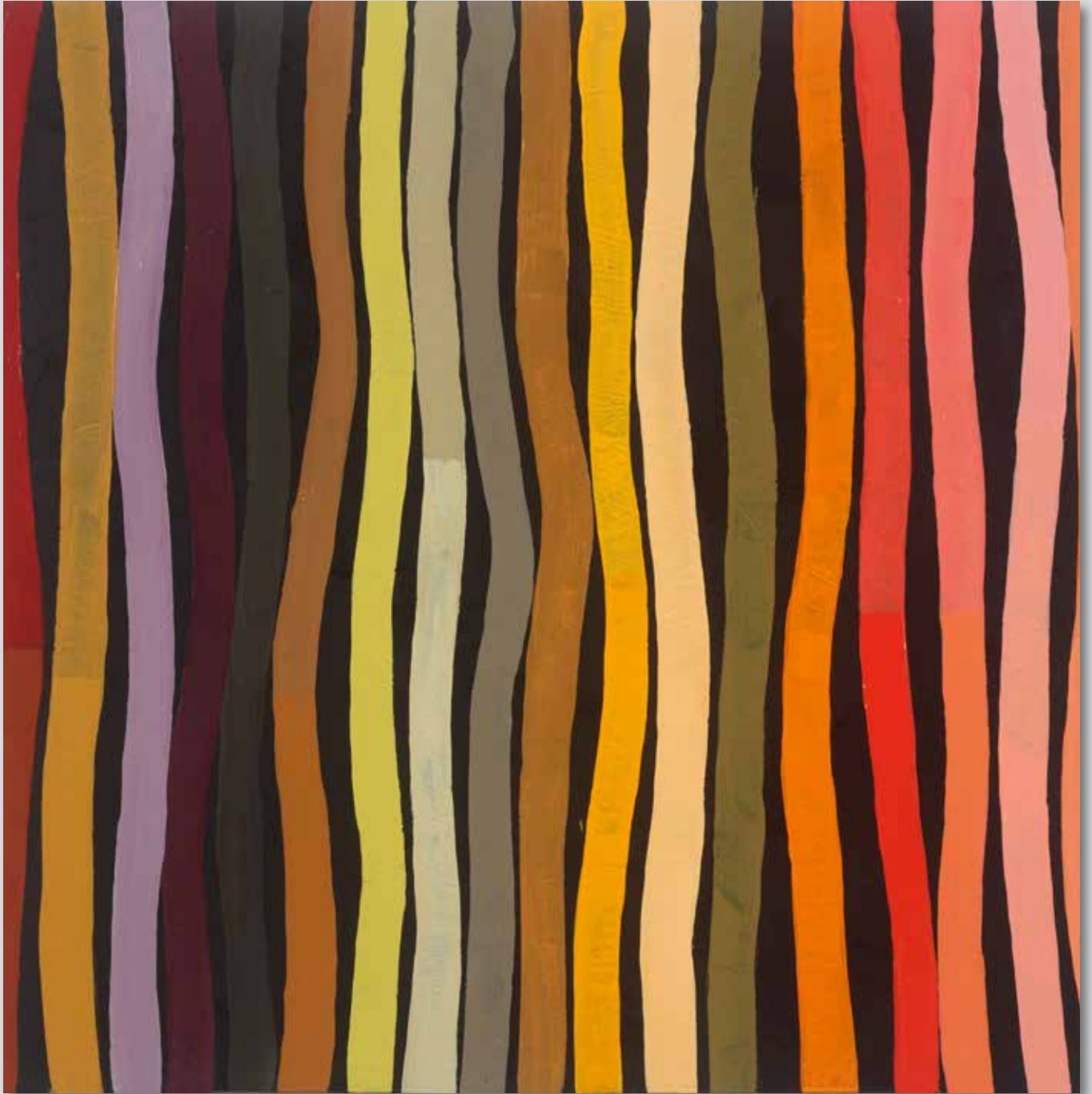
Going with the Flow #3 20"x20", acrylic on wood panel