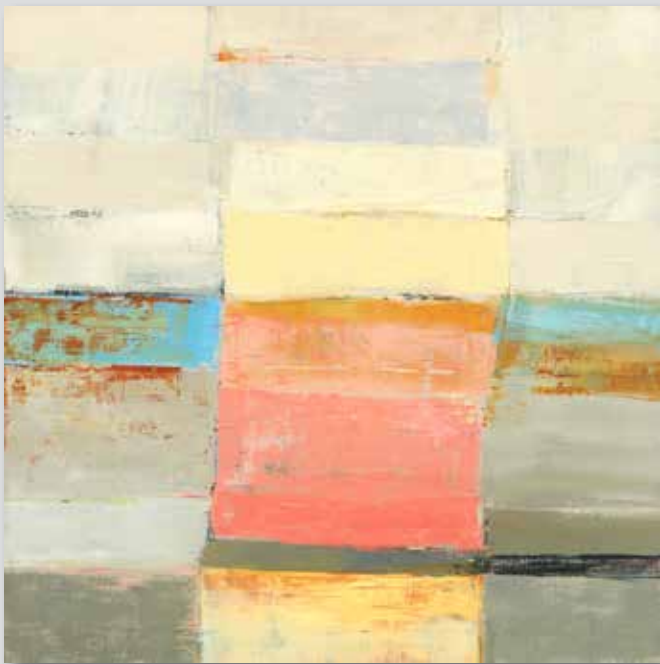
Stacked Stripes #3 12"x12", acrylic on wood panel